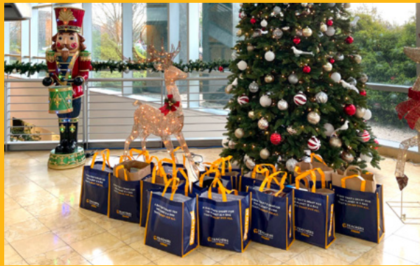
IMAGE HERE EPO ONLY

We "adopted" local families in partnership with The Salvation Army, the Family Service League, Habitat for Humanity and Patchogue Medford Youth & Community Services. Hats, gloves, scarves, toys and food baskets were given to help make the holidays more enjoyable for those in need during an already challenging year.