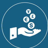
Checking & Savings