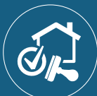
Mortgage & Home Equity Loans